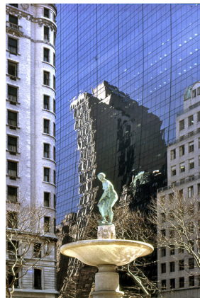
S - Burt Goldstein - 57th Street Reflection