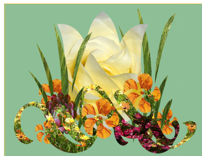
A - Pat Wilkinson - Field of Flowers